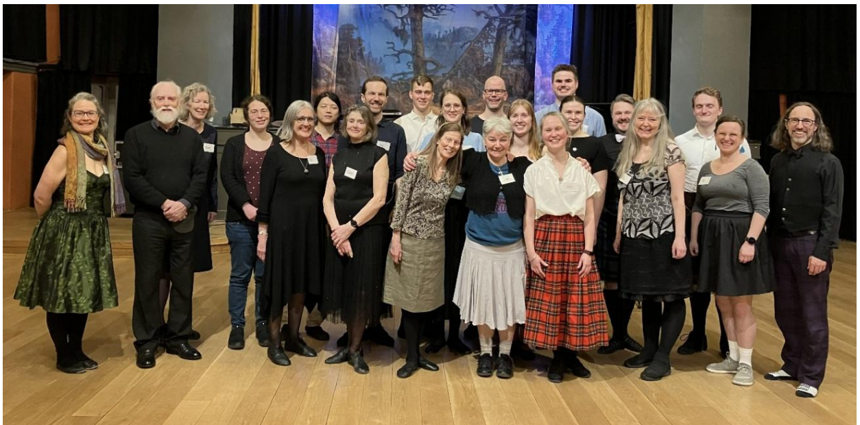
The members of Oslo Scottish Country Dance Group attending the weekend.