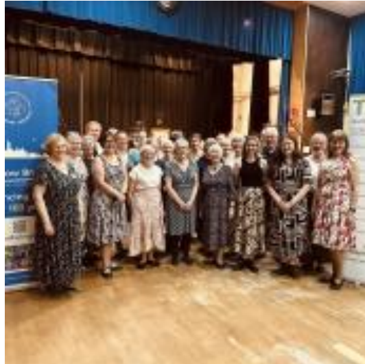
TAS members at the Glasgow Branch Dance

For some TAS members, our Workshop started on the Friday evening when twenty-something members attended the Glasgow Branch dance in Milngavie Town Hall. An excellent evening with 100 plus dancers including a fair number of youngsters (from this geriatric's point of view) from the University Club. Great to have them with us and to dance with them.