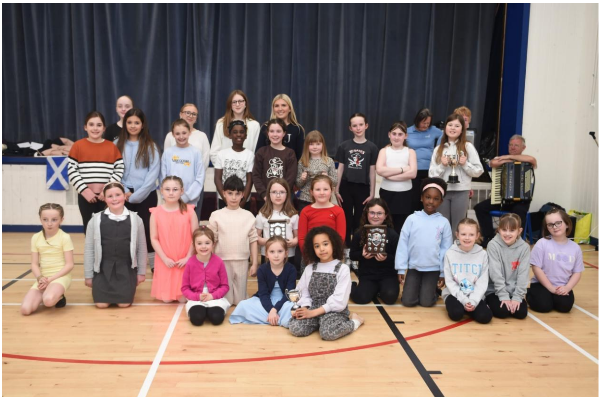
Smiles all round from Award winners and participants alike