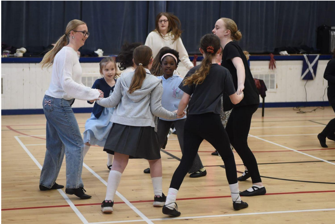
Joining in with the fun!